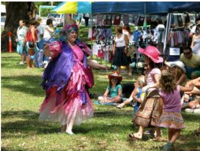
Bundeena in the Royal National Park

Further information www.artofliving.com.au